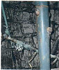
512 Main Varna

If you need assistance or have questions, call the Varna Water Department 309-238-2241 or 815-760-1644